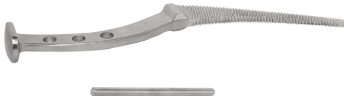
2304-07 Murphy Lane Bone Skid