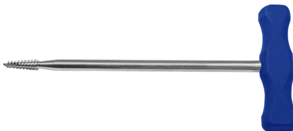
2304-10 Spare Hook For Extractor