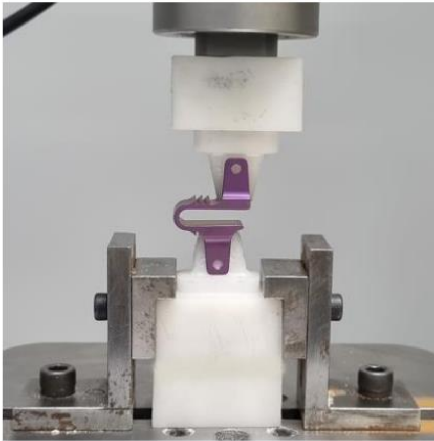
Fig: Test Setup