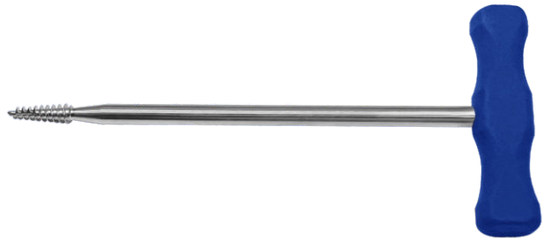
2304-10 Spare Hook For Extractor