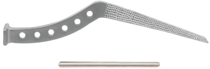
2304-07 Murphy Lane Bone Skid