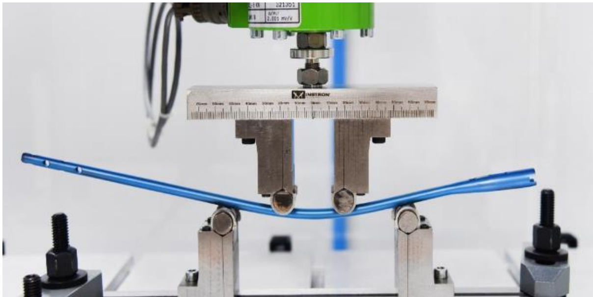
Fig: Test Setup