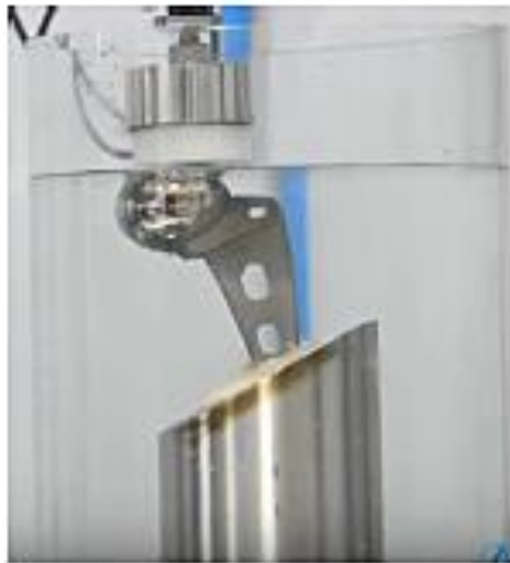
Fig: Test Setup