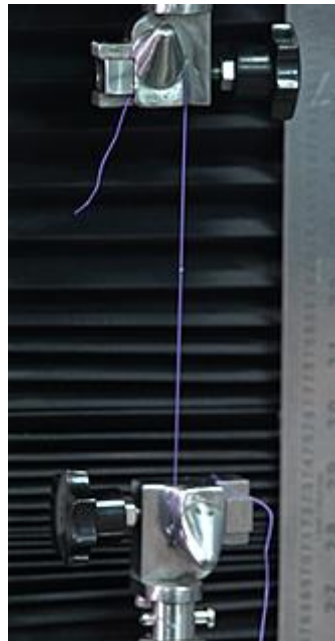
Fig: Test Setup