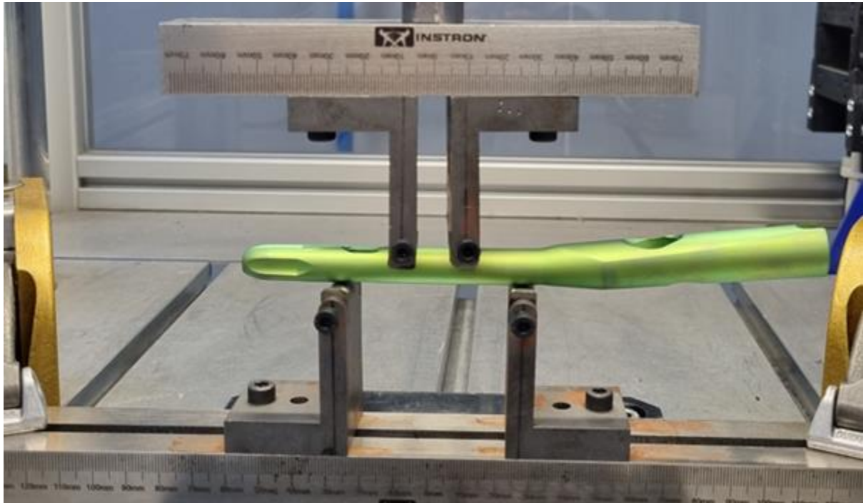
Fig: Test Setup

130° Ajax Advance Nail, Short, Dia. 11mm, Length-170mm, Titanium