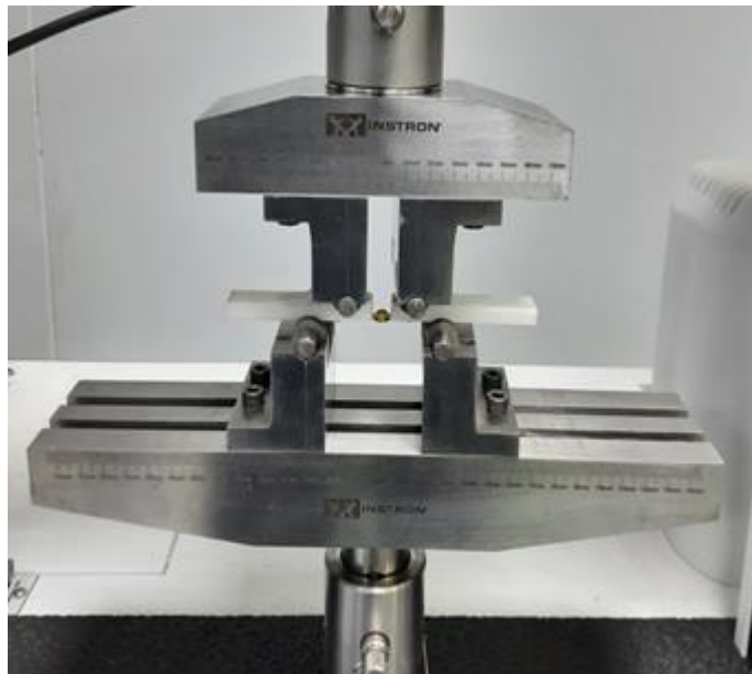
Fig: Test Setup