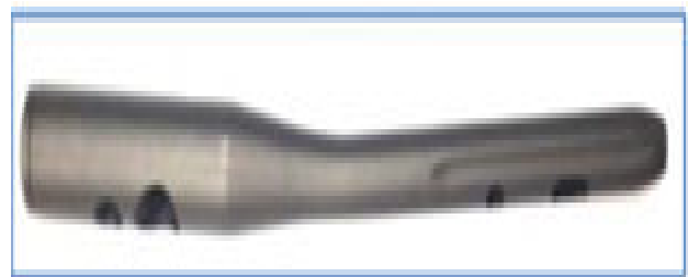
Figure 4: Gamma nail.

Major complications like infection, irritation, and implant failure have been reported by previous studies with the use of intramedullary nails. In our study, intramedullary nail was used and there were 32 patients, among which none had complaint about pain, infection, or irritation at the final follow up. No complication was obtained at final follow up. There was a small difference between VAS score of the both groups. The VAS score has shown good acceptance outcomes. So, the gold standard for treatment of femoral fracture is intramedullary nail. If we consider for full weight bearing, it has been suggested that intramedullary nail fixation is of first choice, regardless of any factor in treating femur fractures. 3,4