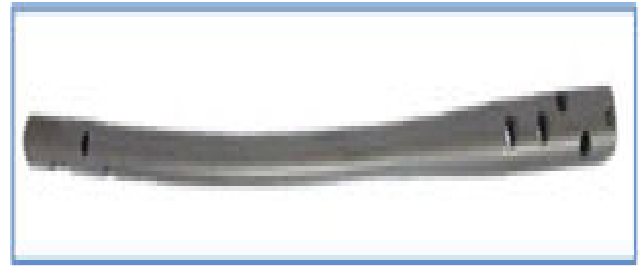
Figure 1: Retrograde femoral nail.

Femoral fractures are a common obstacle in orthopaedic trauma. There can be various types of fractures including proximal, diaphyseal and distal region fractures. There are various methods for treatment of femoral fracture viz. skeletal traction, bone plates, intramedullary nailing, rehabilitation. However, more frequently femoral fractures are seen to be treated with intramedullary nails, such as gamma nails, proximal femur nailing anti-rotation, and retrograde femoral nails (Figure 1-4).